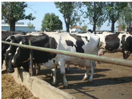
Figure 3. View from a Dairy Farm in the NE part of Romania

Milk price is deeply influenced by offer/demand ration and also by milk quality. At present, milk quality is determined not only by fat percentage but also by number of somatic cells and number of pathogen germs. Even though milk price has continuously increased, farmers are complaining that it is