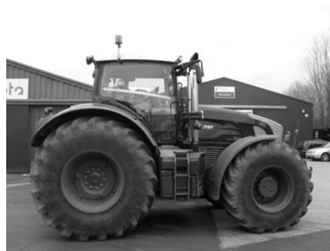
Tractor 2 Fendt 930