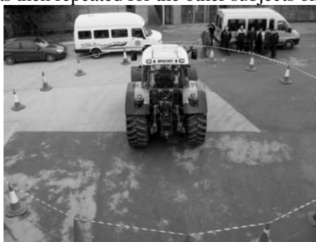
Fig. 3. Showing testing area

The field of vision for the three test subjects was marked on the ground surrounding the tractor. This process was then repeated for the other subjects on the same tractor.