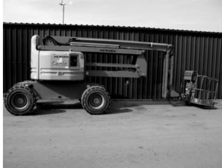
Fig. 2. The cherry picker used for aerial photographs. A 2008 Genie Z60/34