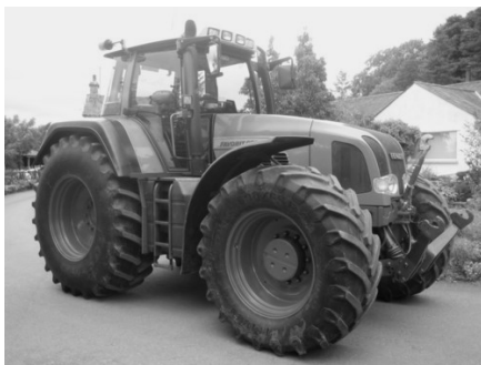
Tractor 1 Fendt 926

For the testing 2 tractors were used of similar physical size and hp.